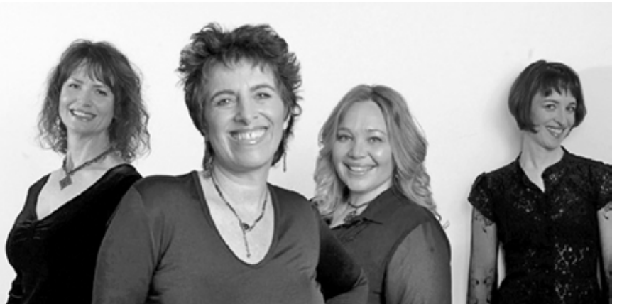
Vocolot in concert! Sunday, March 21, 12:30 p.m.