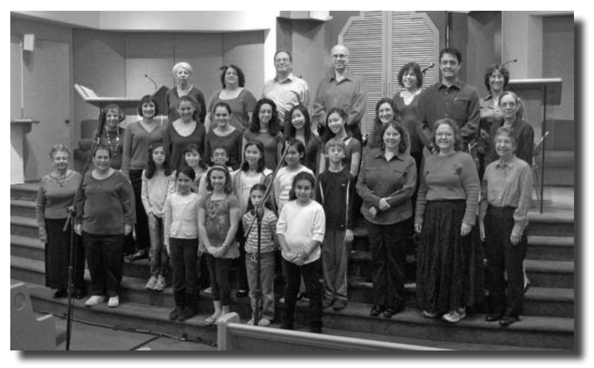
March 21 brought the musical group,Vocolot, to Sinai for a spectacular concert that included our Temple members as an intergenerational choir.