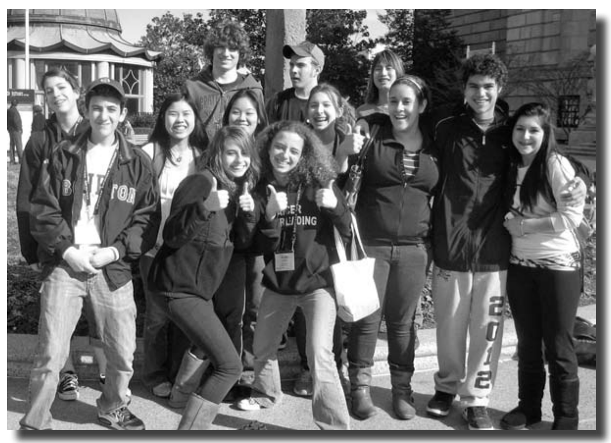
Sinai's 9th and 10th graders visit the Religious Action Center of Reform Judaism in Washington DC early in March.