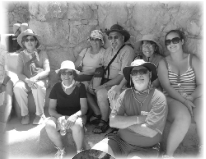
Scenes from Sinai's Trip to Israel