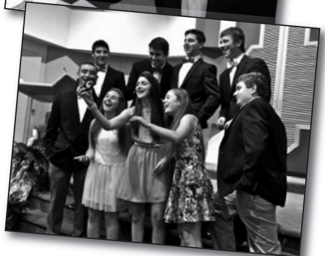
Images from a fabulous Confirmation. June 2014