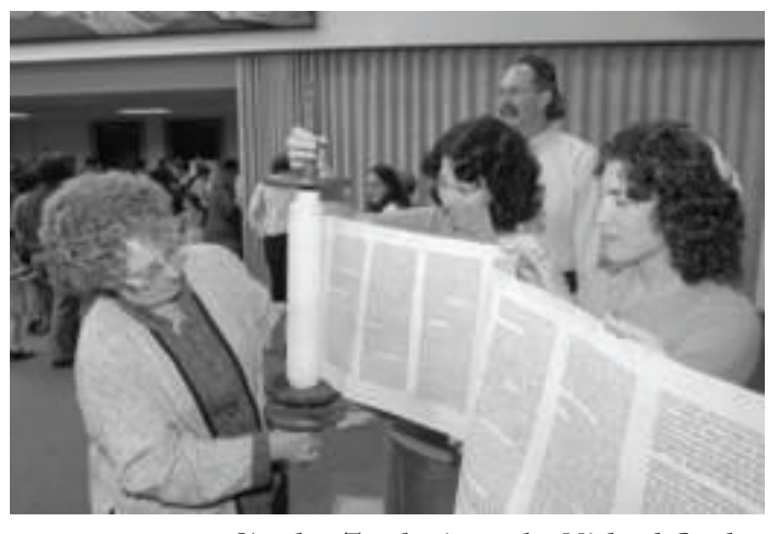
Simchat Torah

Medals were won, friendships were made and a fantastic time had by all. Maccabi 2008 will be in either Detroit or San Diego. For those who will be between 13 & 16 on August 1, 2008, kick off party will be at the JCC on Sunday, November 18 at 6:30 PM.