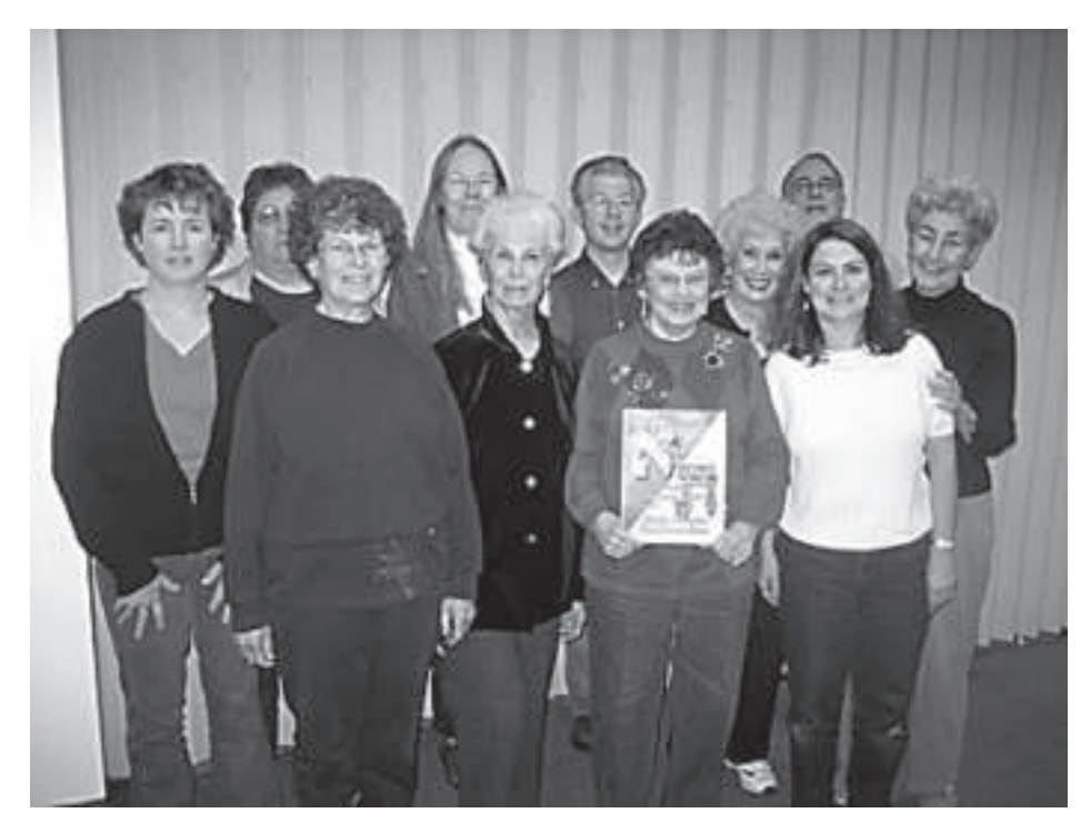
Our Project 75 Hebrew program is going full swing with students at all levels meeting many times during the week. Pictured here is our Sunday morning beginner's class.

Prayerbook: Rabbi Shapiro Biblical: Rabbi Shapiro Conversational: one of Sinai's Hebrew School teachers, Gita Gilad.