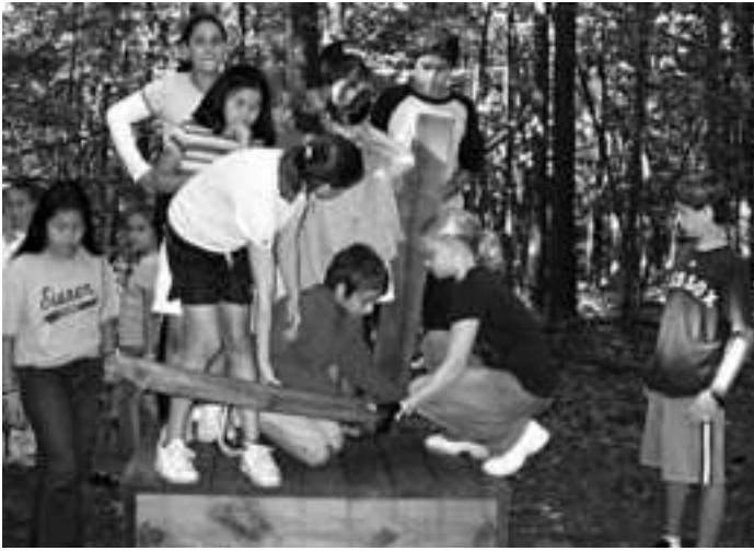
On October 2nd, 5th and 6th graders in Club Hey-Vav learned to work together at Springfield College's low ropes course.