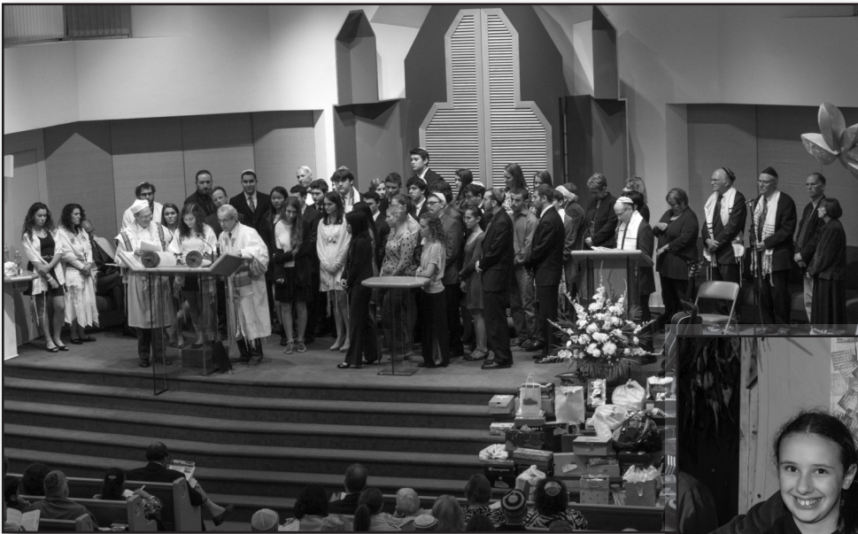
Yom Kippur Morning Torah Reading