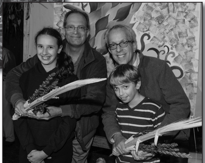
Lulav and Etrov on Sukkot