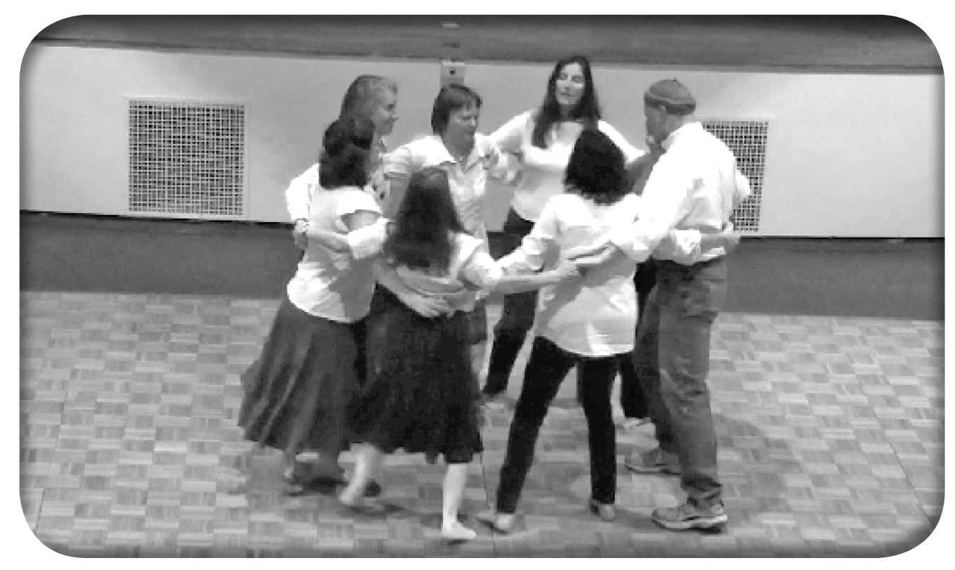
An Israeli dance by Sinai congregation members was presented as part of Sinai Temple's celebration on April 12 of the 65th Anniversary of the creation of the state of Israel.

NON-PROFIT ORG. U.S. POSTAGE PAID SPRINGFIELD, MA PERMIT NO.537