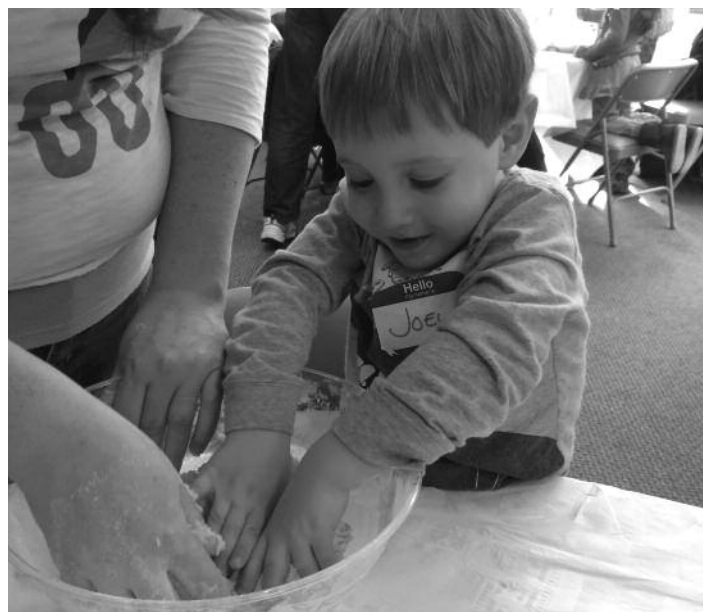
Kneading challah dough