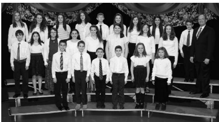
"Shir Fun!" in the WGBY studio