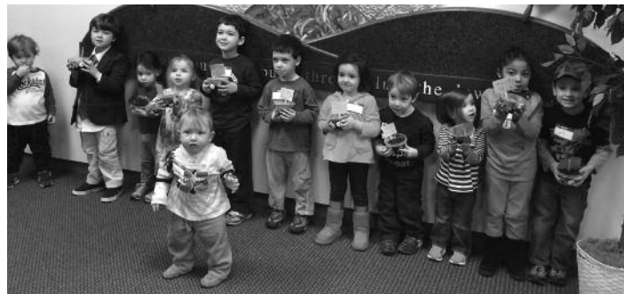
Our pots of parsley seeds