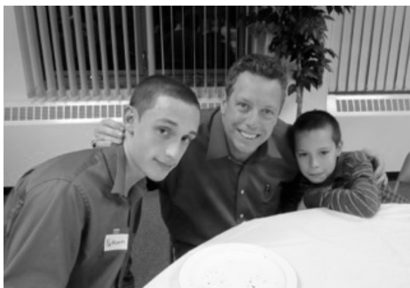
Fathers and sons enjoying themselves at our December program for boys.

If you know someone who needs transportation or if you are someone who wants to volunteer as an occasional driver, please call the Temple office as well.