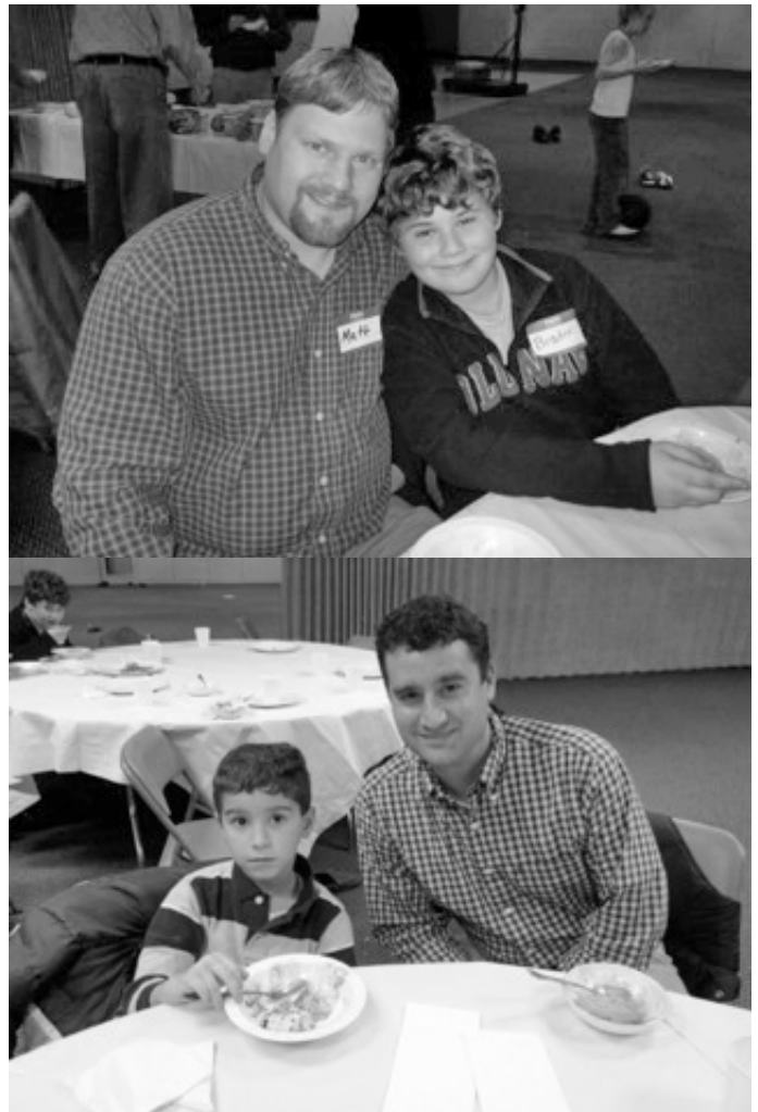
Fathers and sons enjoying themselves at our December program for boys.

This conversation at Sinai is part of a larger listening campaign being conducted by PVP to find ways for strengthening our city.