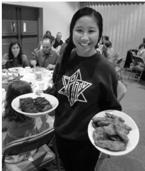
First Night of Chanukah at Temple